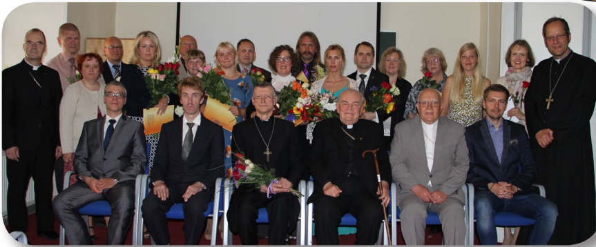
17 students graduated on June 17, 2016.